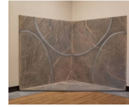
Title: Soft Landing Date: 1970 Primary Maker: Shirley Smith Medium: Acrylic on unbleached muslin and acrylic on stone