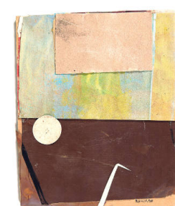
Title: Title unknown (abstraction with dot) Date: 2010 Primary Maker: Shirley Smith Medium: Collage on paper