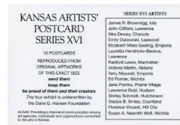
Title: Title/information card Date: 1993 Primary Maker: Association of Community Arts Councils of Kansas Medium: Photomechanical reproduction on paper