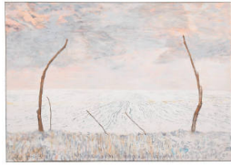
Title: Kansas Gate Posts Date: 1985 Primary Maker: Shirley Smith Medium: Oil on canvas