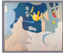
Title: Title unknown (abstraction in blue, brown, and orange) Date: 1970 Primary Maker: Shirley Smith Medium: Canvas collage