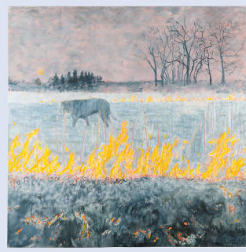
Title: Burning Field Date: 1994 Primary Maker: Shirley Smith Medium: Oil on canvas