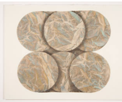
Title: Title unknown (circle series, gray and blue) Date: 1970 Primary Maker: Shirley Smith Medium: Acrylic on unbleached muslin