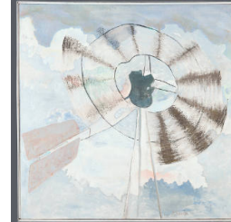
Title: Title unknown (windmill) Date: 1990 Primary Maker: Shirley Smith Medium: Oil on canvas