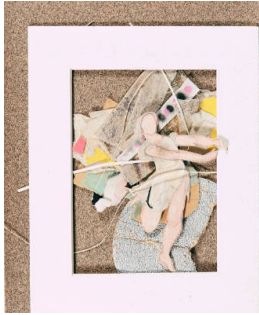
Title: Title unknown (dancer) Date: ca. 2005 Primary Maker: Shirley Smith Medium: Collage of paper on paper