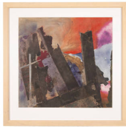
Title: Vietnam I Date: 1965 Primary Maker: Shirley Smith Medium: Canvas and collage of found paper with acrylic mounted on hardboard